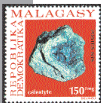
Agate and stamps from Madagascar