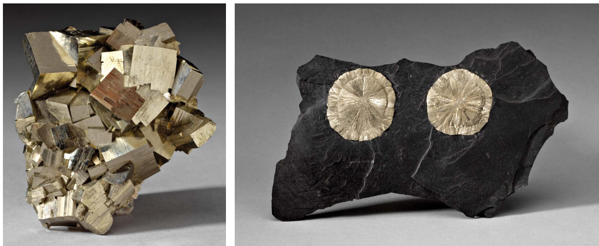
FIGURE 1. (left) Coarse grained pyrite showing the distinctive cubic form. (right) Pyrite nodule in shale.

Gritty Details). In the open oceans, because there is always a lot of sulfate around, the \delta^{34}\text{S} value remains nearly constant. When pyrite forms deep in the sediments at the ocean's floor, the \delta^{34}\text{S} of that pyrite will start out low (approximately -40\% compared to starting sulfate \delta^{34}\text{S} ). As long as there is ample sulfate to consume, the bacteria will choose to use the ^{32}\text{S} first (Fig. 2), and the \delta^{34}\text{S} will remain low. But as the initial sulfate is used up the bacteria will consume more of the heavier ^{34}\text{S} . More and more consumption leads to less and less sulfur overall, producing higher and higher \delta^{34}\text{S} values. Therefore, high \delta^{34}\text{S} in the rock record tells us that the sulfate reducing bacteria at that location and time, were running out of sulfate and, in a manner of speaking, starving.