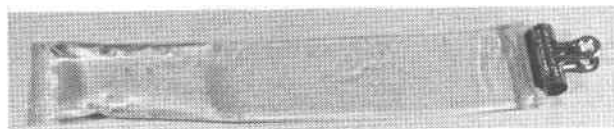
FIG. 2. Mixing bag sealed at one end with clamp. Most of the epoxy-hardener mix is at one end. A pinhole at one corner of the bag permits controlled dispensing of mixed epoxy. Bag is 20 cm long.

Epoxy resins are particularly useful, because of their great strength, in the initial adhesion step of preparing petrographic thin sections when the rock slab is bonded to the glass microscope slide and then thinned on the cut-off saw. Adhesion of the cover slip, however, does not require a particularly strong bond and a substitute for epoxy, called Eukitt, may be used instead. It is distributed by Calibrated Instruments, Inc., 731 Saw Mill River Road, Ardsley, New York 10502. When dried, Eukitt is nearly as strong as epoxy and is probably as long lasting on the slide since it does not discolor or become brittle with age. In addition, it is isotropic, colorless, clear, bubble-free; it requires no mixing, curing, clamping, or oven heating; and slides may be studied (with care) a few