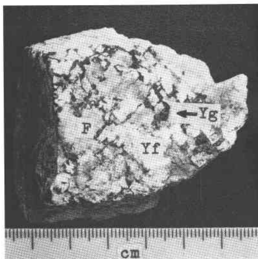
FIG. 1. Yttrian garnet and yttriofluorite. Yg: yttrian garnet, Yf: yttriofluorite, F: potash feldspar.

The refractive index was determined with the immersion method. Under microscope the material is optically isotropic and the measured