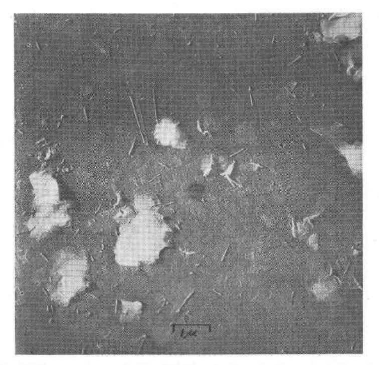
FIG. 21. Electron micrograph of the 200–70 m \mu fraction of sodium saturated montmorillonite, Clay Spur, Wyoming, prepared from a water suspension which was evaporated onto a Formvar film supported on a standard screen, Pd—shadowed.

This explanation cannot be applied to montmorillonite since, in accordance with the Hofmann-Endell-Wilm structure, it has silicon-oxygen layers on both sides of an octahedral layer. Furthermore, there is not a continuous hydroxyl layer present. In this three layer structure, substitution in the tetrahedral or octahedral layers gives rise to equal forces on both sides of the "sandwich" and cannot produce curling. The curling which has been observed has always been in an upward direction and appears, therefore, to be due to drying effects during preparation and observation of the sample.