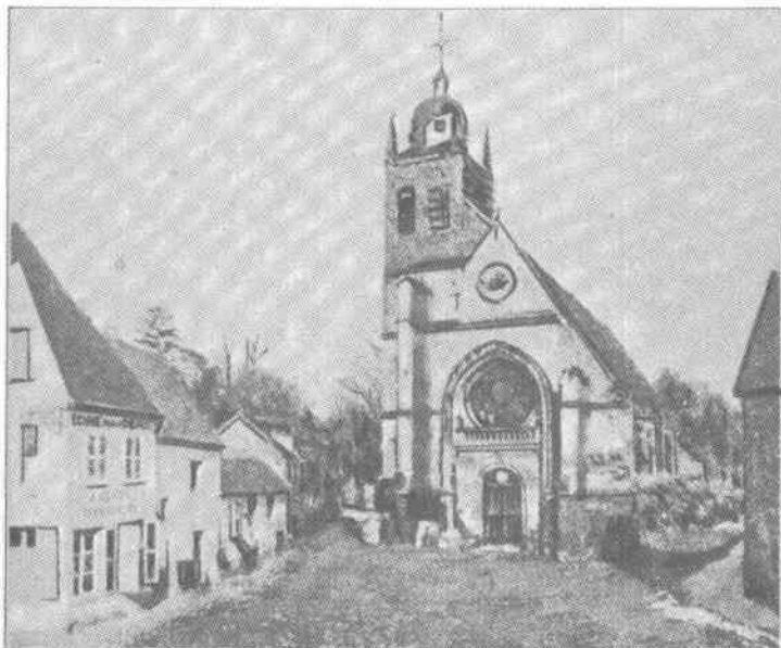
OLD CHURCH AT ST. JUST-EN-CHAUSSÉE, where Haüy was chorister in his childhood; from biography of Haüy in the series "Les Contemporains."