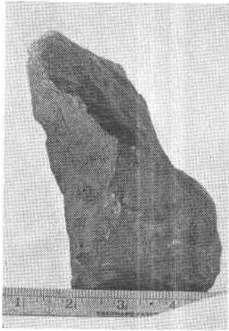
FIG. 1. Illustrating the general shape of the meteorite.

This specimen proved to be a meteorite and it has been given the locality name: Soper, Oklahoma meteorite, by the authors.