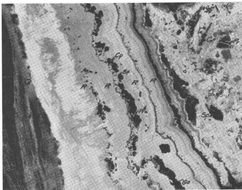
FIG. 4. Colloform bands of rhodonite (R) with sulphides, chalcopyrite (cp), sphalerite (sp) and pyrite (pr). Area beyond last continuous band shows portions of collapsed ones. Initial crust of quartz (q) on wall rock. Kapnik, Roumania.

The colloiddally deposited zinc sulphide from Moresnet, Belgium (Fig. 3), shows a strikingly banded appearance, with alternating light and dark ribbons. This rhythmic coloration, in bands of uniform texture is probably caused by the adsorption of varying amounts of iron compounds. Discontinuous bands of galena and marcasite may be interbanded with the zinc sulphide. The lead sulphide was undoubtedly deposited from a molecular solution, which diffused through the colloidal zinc sulphide, the cubes of galena having replaced some of the sphalerite in the bands.