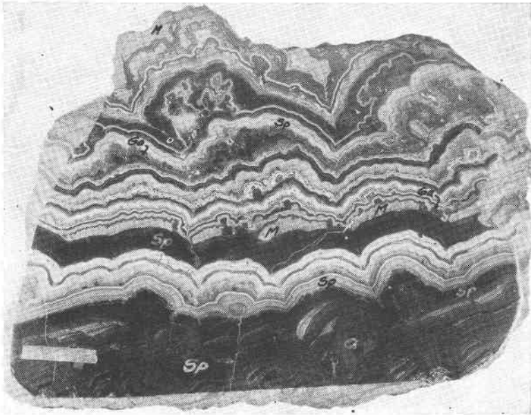
FIG. 3. Colloform bands of zinc sulphide, the bands colored probably by adsorbed iron compounds. Moresnet, Belgium.

The term colloform has been widely used by geologists, 21 to include a number of structures that have been usually attributed to colloidal deposition. Colloform structures when examined in thin section appear to be crystalline, or sub-crystalline (amorphous).