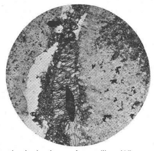
FIG. 2. A section showing the coarsely crystalline middle zone of clear quartz and dark, euhedral titanite surrounded by diopside. The same minerals appear on the margins of the middle zone but of considerably smaller dimensions. Snoqualmie Pass, Washington. 12 \times .

Where the quartz-diopside veinlets traverse these metamorphosed basic lavas their mineral composition is radically changed. Calcite appears as a late mineral. Garnet becomes noticeable, and in some veinlets may exceed 50 per cent of the mineral composition. With this increase in garnet there is a corresponding decrease in diopside and titanite. The amount of quartz varies from 0-50 per