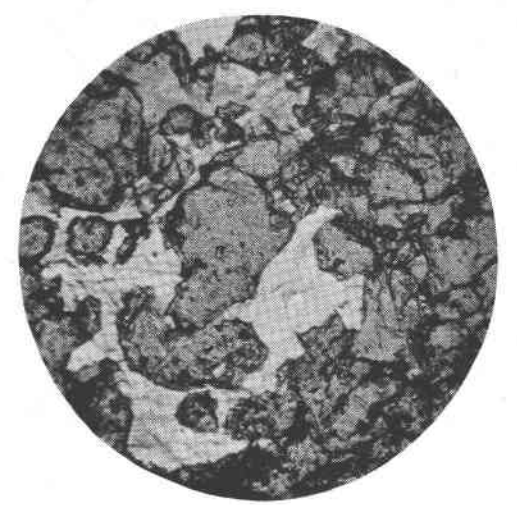
FIG. 3. Section of a garnet-rich veinlet showing later quartz and calcite. Cornucopia, Oregon. 35 \times .

Structures similar to those of the quartz-diopside veinlets prevail. There are, however, some minor differences such as a coarser central band of diopside in the midst of the quartz and garnet of the middle zone. Another feature peculiar to the garnet veins is a small but definite band of kaolinitic material along the outer margin of the transition zone and the country rock. It persists as an irregular band of fine, cloudy material averaging 0.15 mm. in width wherever the veinlets traverse the basic lavas. It is lacking where they traverse the schist. Another noteworthy feature is the presence of chlorite and pyrite commonly occurring in the upper reaches of the veins several hundred feet above the actual granodiorite contact.