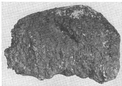
FIG. 1. Side view of Springwater meteorite showing surface pitted by friction in the atmosphere. The white marking at the top represents an incrustation of calcium carbonate.

The meteorite weighed 41 lbs. (18,570 grams) and was about the shape one would obtain by cutting a standard baker's loaf through the middle on a plane vertical to its base, and departing about 10 degrees from a right cross section. Its base measuring 25×20 cm.,