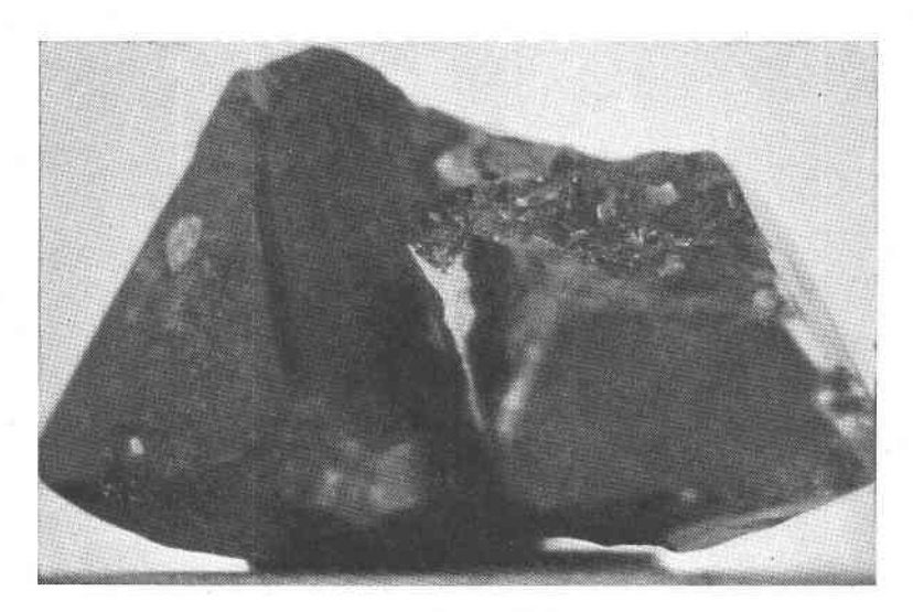
Figure 2. Franklinite.