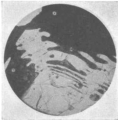
Fig. 1. Photomicrograph of a portion of a skeleton quartz crystal from Agate Point, Lake Superior. Magnification about 17\times . Ordinary light.

Quartz phenocrysts of unusual crystal habit were found by the author in rhyolite vitrophyres from Agate Point, forty miles east of Port Arthur on the north shore of Lake Superior. These crystals have three plates of solid quartz intersecting at 60^\circ , whose out-