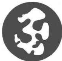
Fig. 7. Normal quartz phenocryst from Agate Pt. vitrophyre which has attained growth and complete exclusion of magma but which has been resorbed at a later stage.

of the films near the centre of the phenocryst is more coarsely crystalline than where it is associated with the natural glass and furthermore, the reorganized borders of the films are in crystal continuity with the main mass of the phenocryst. The microcrystalline quartz is clearly reorganized rock glass from which the impurities have been removed. The purified product thus formed was being recrystallized with the same orientation as that in the main part of the phenocryst.