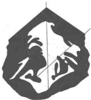
Fig. 4. Skeleton quartz crystal from Agate Pt. completely resorbed, except for half of two axial plates.

Fig. 4 shows a further stage in resorption of a quartz skeleton crystal. One plate and part of another is well preserved. The other parts of the quartz, however, have been dissolved in the magma solution. Fig. 5 shows a still further stage in the destruction of a crystal; only small parts adjacent to two plates remain, and of these remnants only the outer ends are preserved.