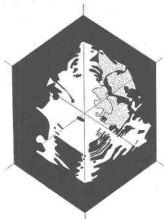
Fig. 2. Skeleton quartz crystal from Agate Pt. Quartz shown in white, vitrophyre in black, and secondary quartz stippled.

Examples of resorption of both euhedral quartz phenocrysts and of skeleton quartz phenocrysts are very abundant in the Agate Point vitrophyres. An example of a typical partially re-