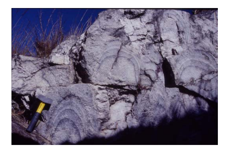
Figure 7 – Outcrop showing spectacular "line rock" structures in an aplitic-pegmatitic dike at Ambalamahatsara, Ambatofinandrahana region.