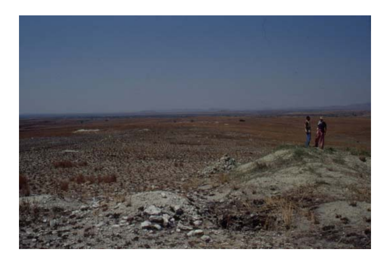
Figure 9 – Outcrop in the area of occurrence of the gemmy yellow K-feldspar. West of the Benono village, Betroka area.