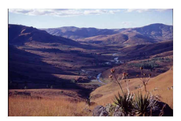
Figure 4 – Landscape of the Sahatany Valley, Antsirabe region.