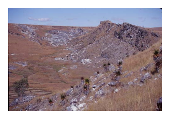
Figure 5 – Landscape of marble hosting pegmatites at Ambalamahatsara, Ambatofinandrahana region.