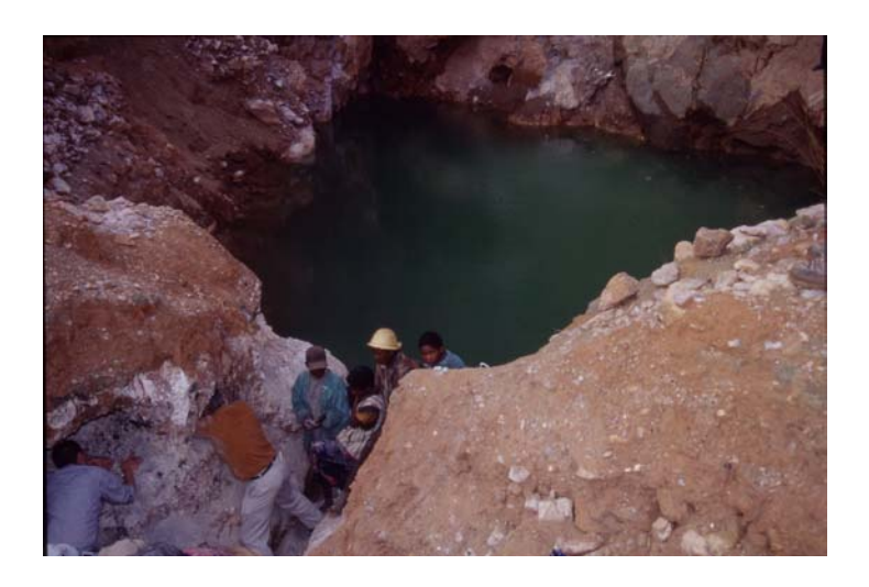
Figure 1 – Participants to the field trip searching blue beryl in the Tsaramanga pegmatite, close to an open pit filled by water. Mahaiza, Betafo region.