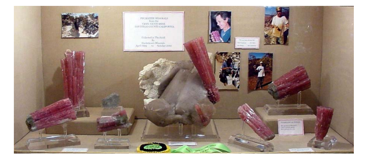
Figure 1 . Tourmaline crystals obtained from mining at the Cryo Genie pegmatite in 2001, on display at the 2002 Tucson Gem & Mineral Show.