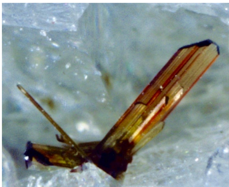
Figure 9. Optical image of euhedral baddeleyite (3 mm) from the San Vito Quarry, Ercolano (Campania, Italy).