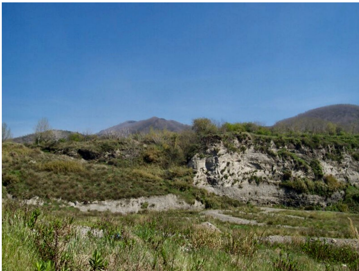
Figure 10. Proximal deposits of Pomice di Avellino exposed in the San Vito Quarry, Ercolano.