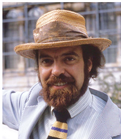
Paul Brian Moore, 1974. (Color online.)

Paul was a prolific describer of new minerals, particularly from Långban, from the Palermo No. 1 pegmatite (New Hampshire), and from the granitic pegmatites of the Black Hills (South Dakota). For him, the description of a new mineral had to involve the solution of its crystal structure, and his almost incandescent enthusiasm for these new atomic arrangements corruscates from the papers involving their description. His early involvement with both basic minerals of Långban-Franklin and acid late-stage minerals of granitic pegmatites gave him a wide appreciation of crystal structures, and he very rapidly developed penetrating insights into the general atomic arrangements of minerals. His paper (Moore 1965) on a structural classification of the basic iron-orthophosphate-hydrate minerals broke new ground in quantitatively relating structural arrangement to chemical composition and, for the first time, emphasized the importance of understanding the different roles of H 2 O in crystal structures. In a paper of true elegance (Moore 1970), he